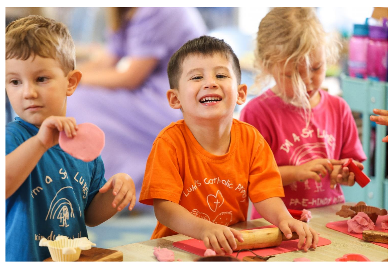
Pre-Kindy Parent Information